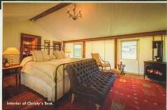
Interior of Christy's Tent.