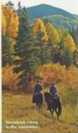
Norwegian riding through autumn colors at the Tipping Cabin.