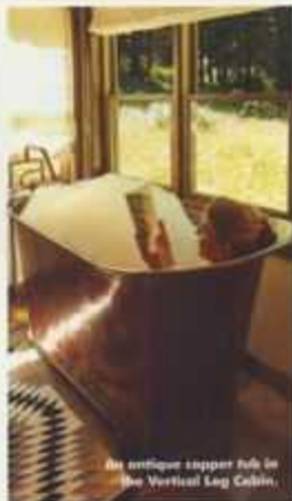
An antique copper tub in the Vertical Log Cabin.

Adventuresome options for a few, but exactly what others have come all this way do, include diverse fly fishing (hours knee deep in the river casting with expert fly-fishing guides) and old-time trail riding on sturdy horses that know the forest paths. Signing up for a hike means a mixture of gentle to lung-torturing climbs, whatever's on the agenda. Less ambitious guests can sile their time away in the mineral hot springs or get "fresh air" and pampering in the up-river spa tent.